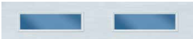
41" x 13" LONG PANEL*

*True White shown; also available in Almond, Wicker Tan, and Sandtone. **Available with black frame only. Available with Clear, Obscure, or Insulated glass.