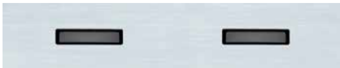
24" X 6" DOUBLE INSULATED ACRYLIC**