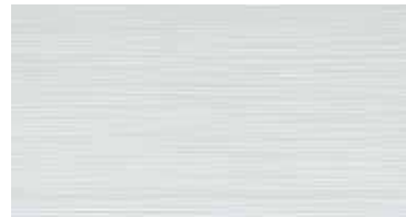
FLUSH PANEL WITH WOODGRAIN EMBOSSMENT