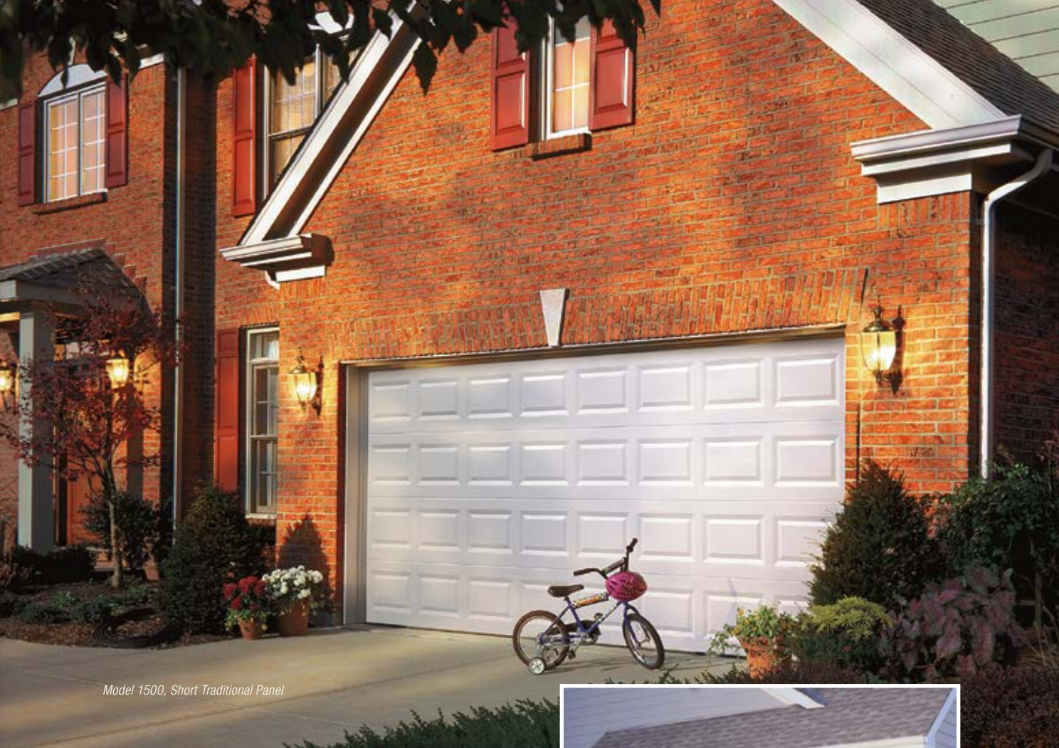
Model 1500, Short Traditional Panel