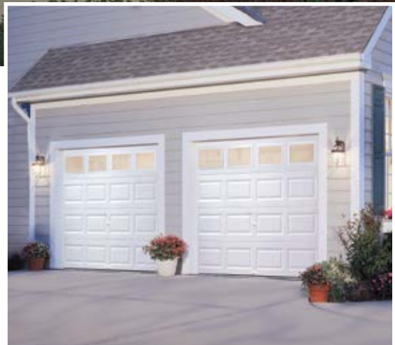
Model T42S, Short Traditional Panel with Plain Short Windows