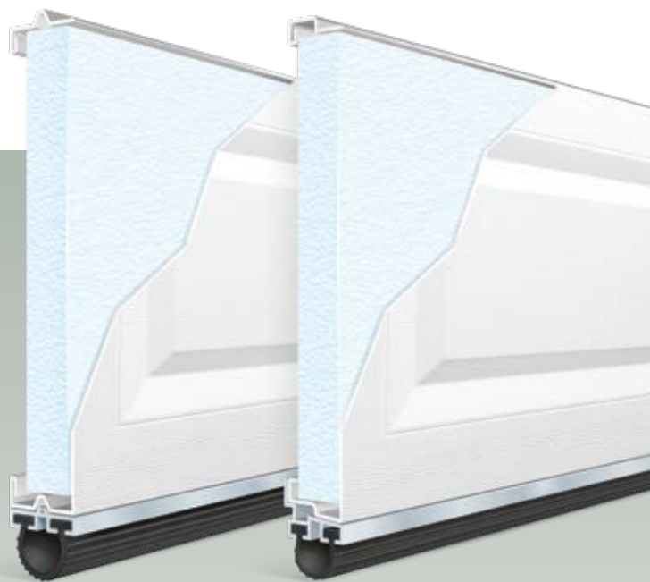
Tongue-and-Groove Section Joints

24 GAUGE STEEL T42S short panel T42L long panel