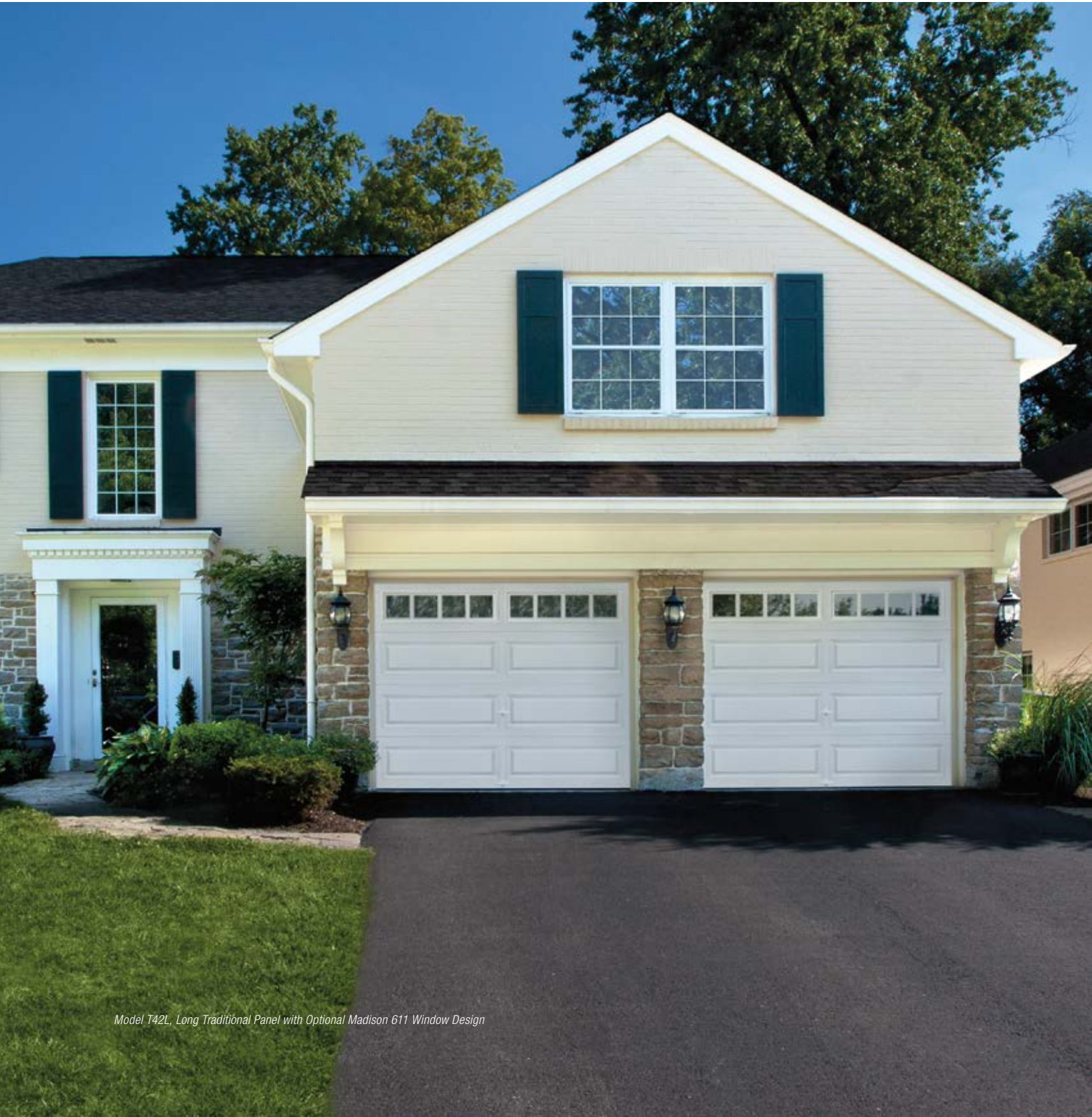
Model T42L, Long Traditional Panel with Optional Madison 611 Window Design