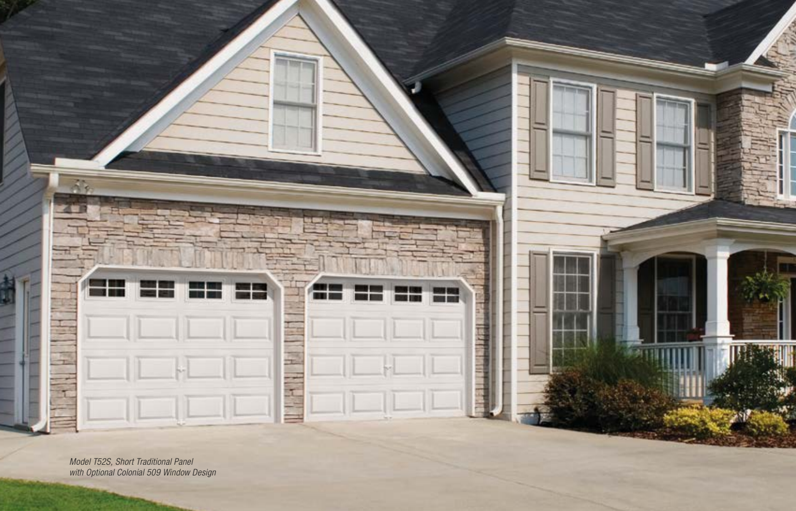
Model T52S, Short Traditional Panel with Optional Colonial 509 Window Design