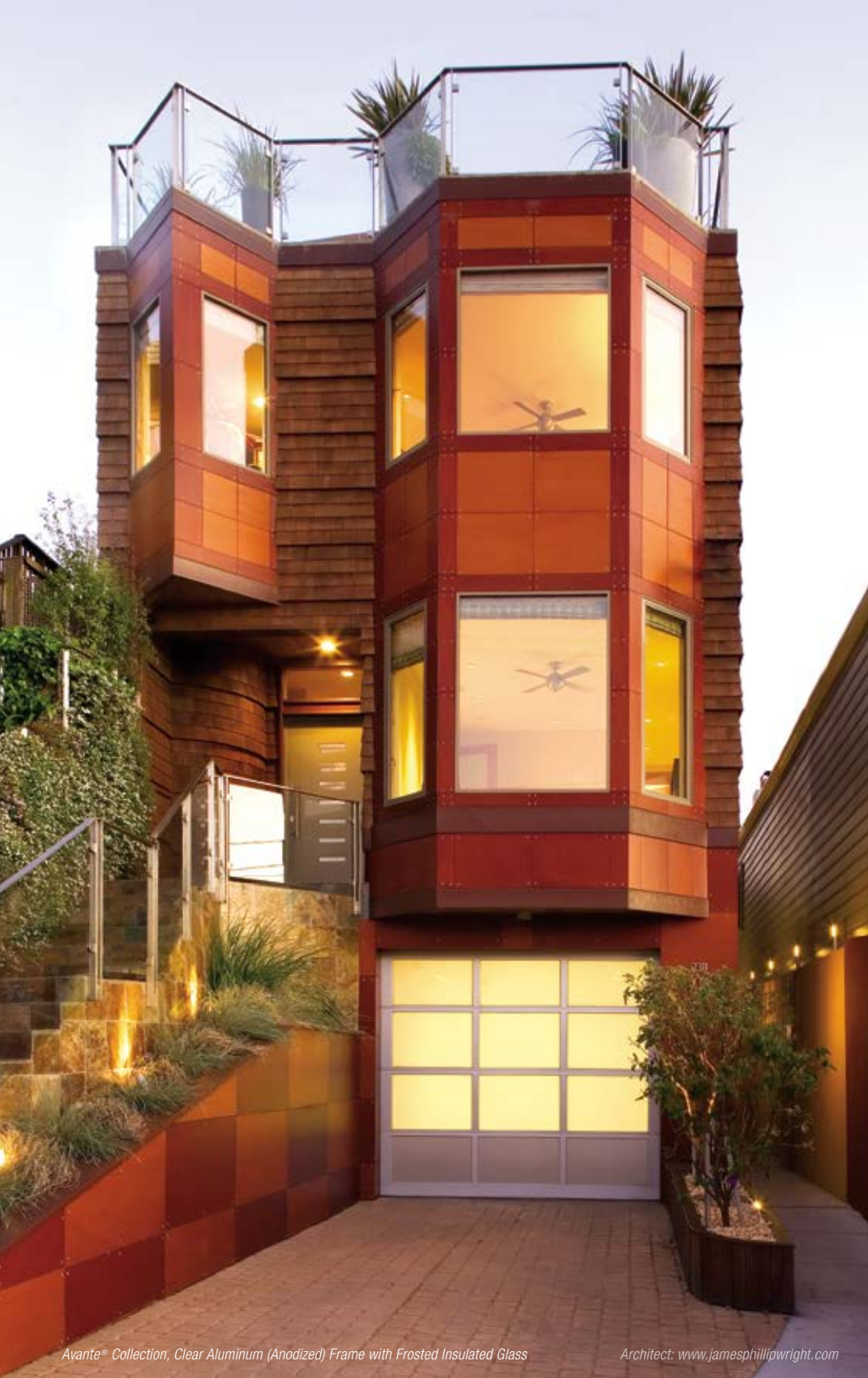
Avante® Collection, Clear Aluminum (Anodized) Frame with Frosted Insulated Glass