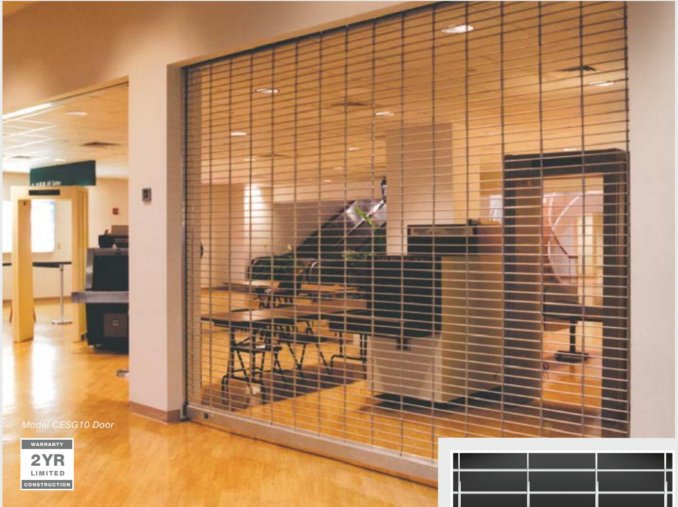
Model CESG10 Door