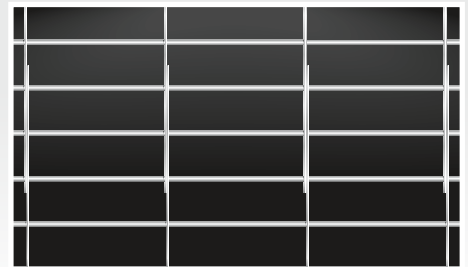
Standard Grille (2" x 3", 2" x 6", 2" x 9")