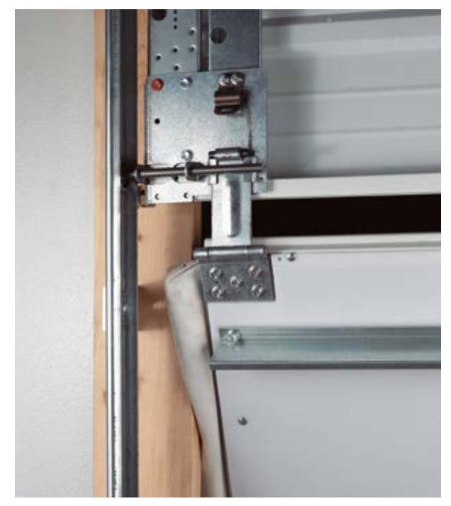
Inside View of Single Bottom Section

Clopay's break-away bottom sections will release from the track and swing up to a full 45° angle inward or outward, preventing further damage to the door. The cable attachment at the bottom of the second or third section enables the door to continue operating after being struck. The bottom sections can be snapped back into place in less than a minute. The bottom sections have a fiberglass or polycarbonate sheet on the inside of the sections to resist dents and maintain an attractive appearance. These sections are available on the 1-3/4" (44.5 mm) and 2" (50.8 mm) thick 3000 Series polystyrene and polyurethane insulated doors, and on all 520 and 524 Series ribbed steel doors.