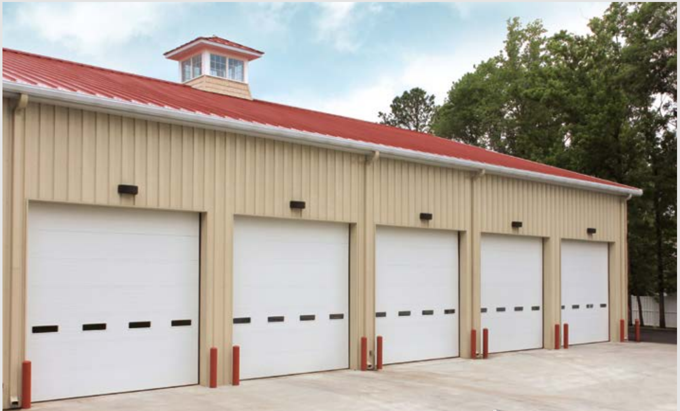
Model 3724, 14'2" x 14' Doors; Shown with 24" x 8" Lites