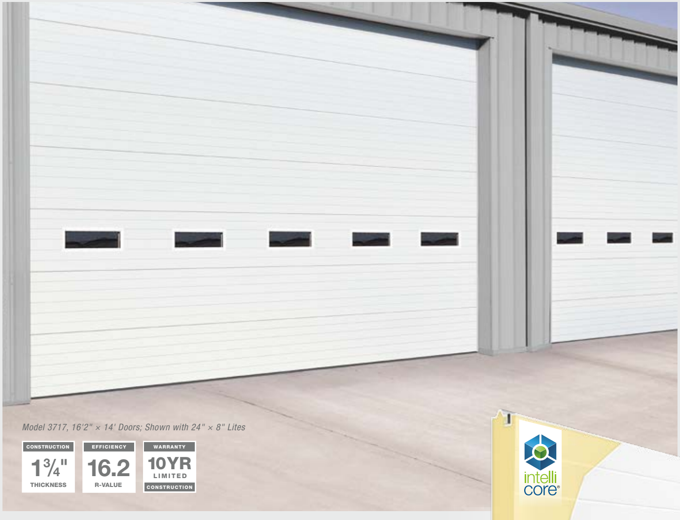
Model 3717, 16'2" x 14' Doors; Shown with 24" x 8" Lites