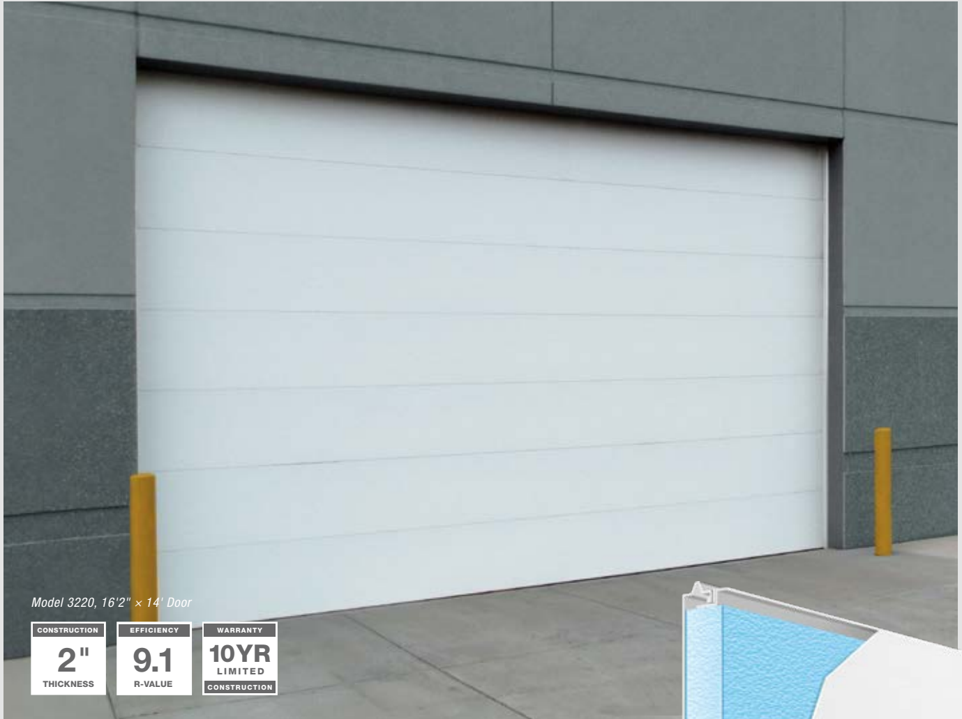
Model 3220, 16'2" x 14' Door