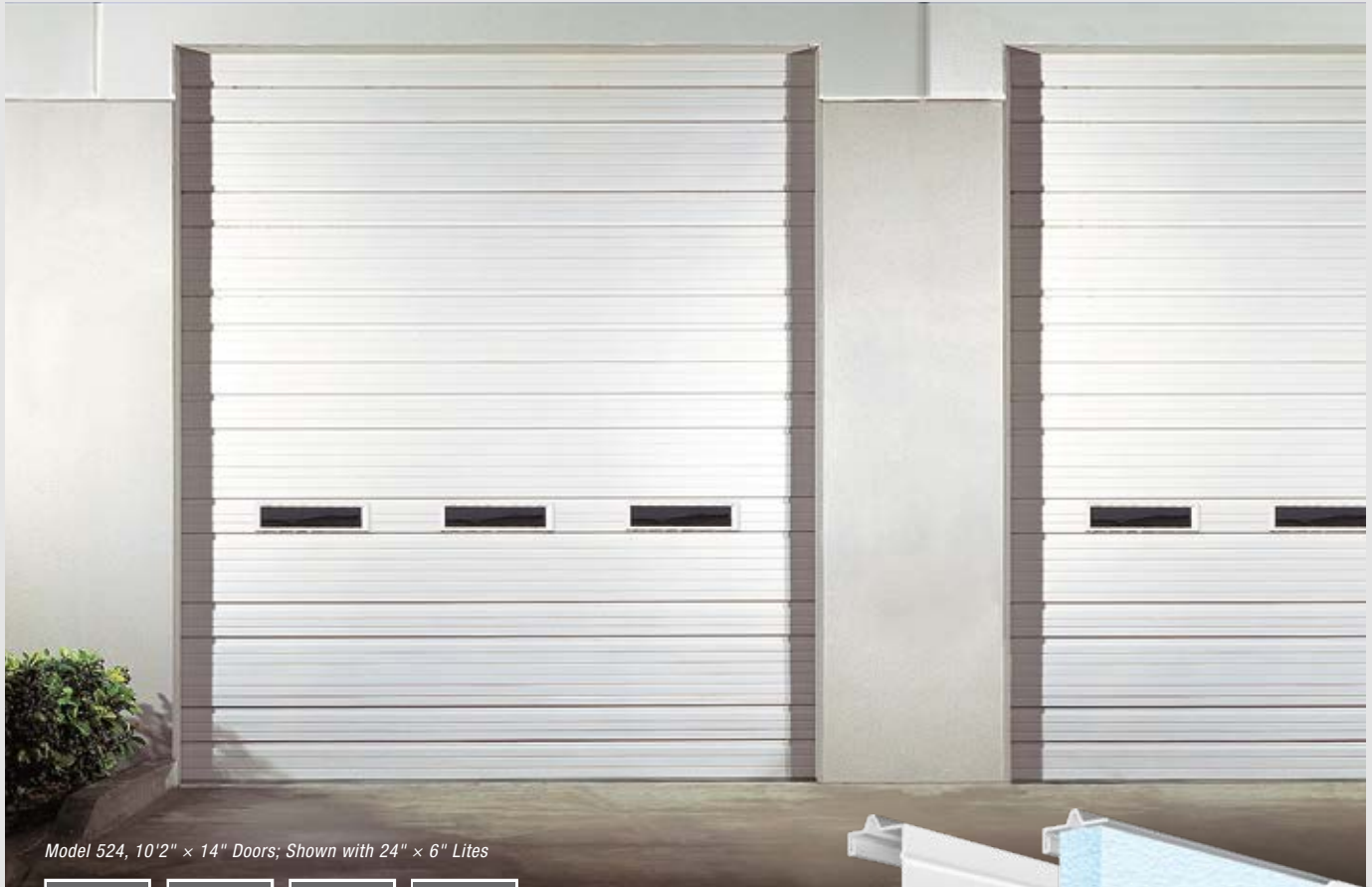
Model 524, 10'2" x 14" Doors; Shown with 24" x 6" Lites