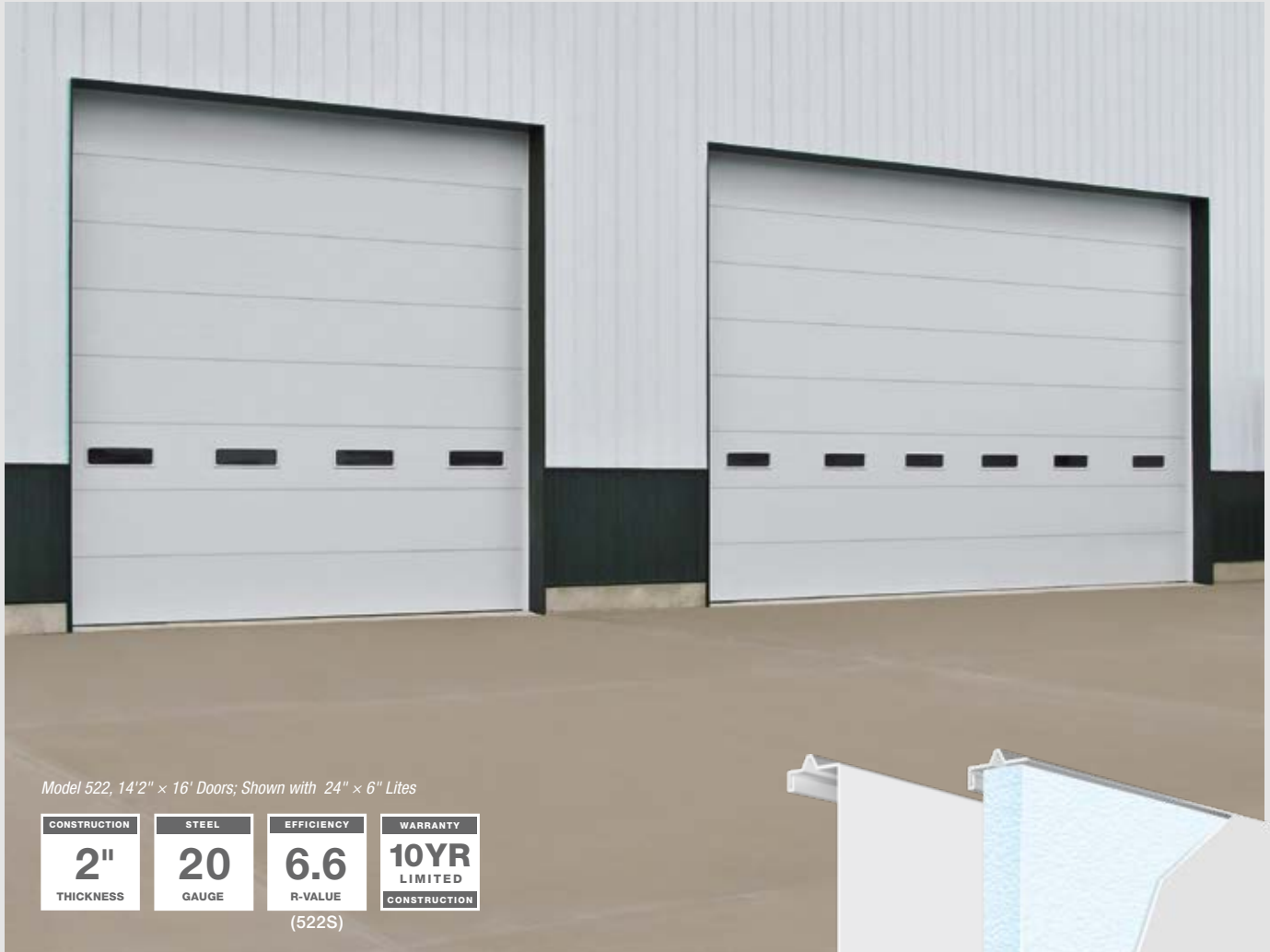
Model 522, 14'2" x 16' Doors; Shown with 24" x 6" Lites