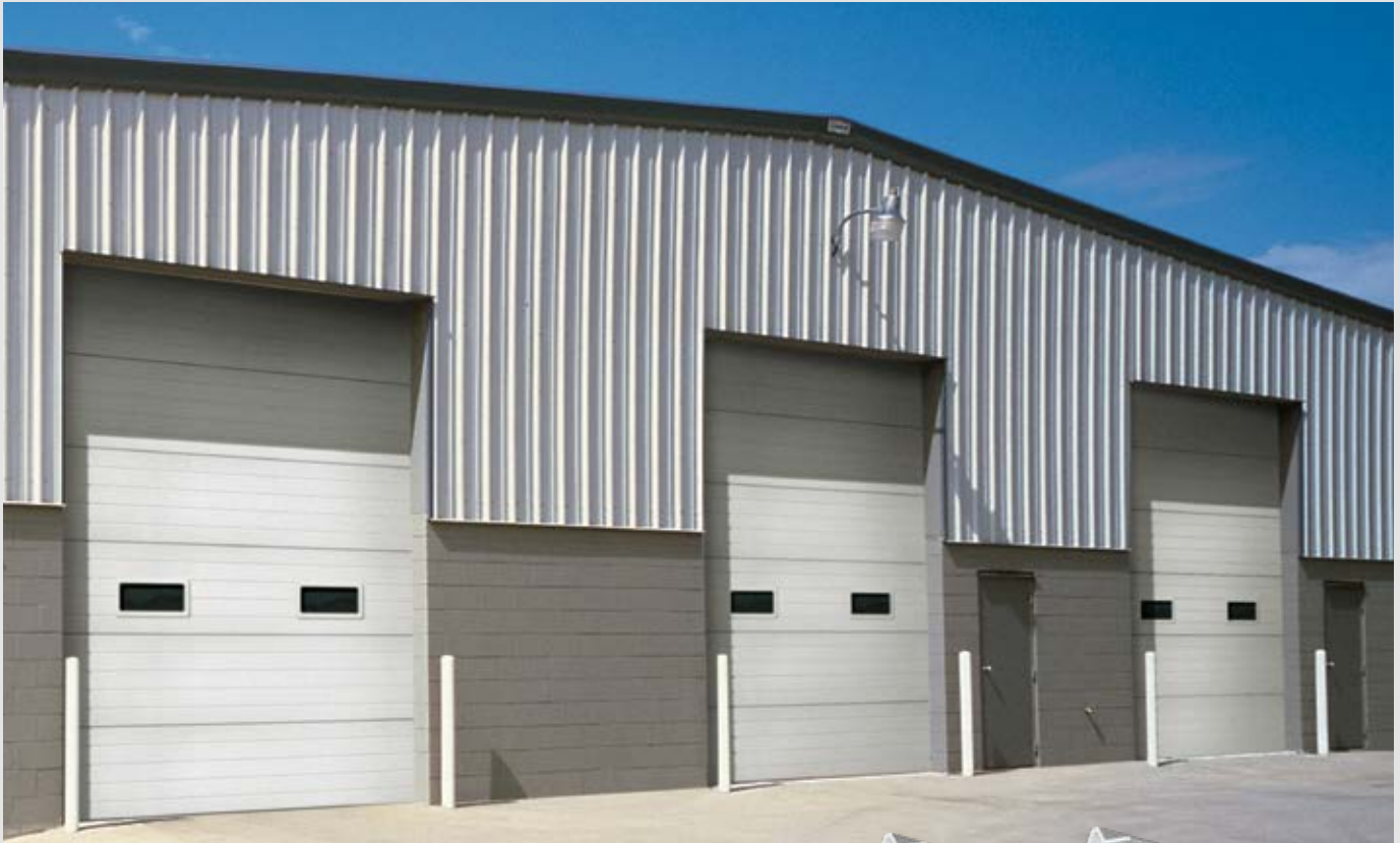
Model 520, 12'2" x 16' Doors; Shown with 24" x 6" Lites